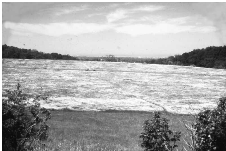
Figure 2. A sharply-demarcated floristic boundary under the control of an edaphic boundary at Jasper Ridge Biological Preserve, San Mateo County, California. The yellow-flowered Lasthenia californica (Asteraceae; in background) is restricted to serpentine soils. The boundary between L. californica and grasses is defined by a serpentine-sandstone transition.

in eastern North America originated in the formation of the ocean floor. Mantle rocks are produced along ocean ridges where partial melting in the upper mantle produces reservoirs of gabbro melt, or magma, that feed basalt lava flows from ocean ridges. As fresh melt is added, lava spreads from the ridges where it cools to form rocks (Wyllie 1979b). The succession of rocks produced from this melting and cooling, from bottom to top, is peridotite (modified mantle), gabbro, and basalt—a sequence called ophiolite. Most ophiolite is subducted, sinking back into the mantle, but some is incorporated into continental crust (Coleman and Jove 1992; Wyllie 1979b).