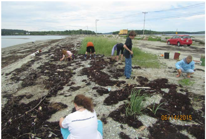
Seventh grade Beach Grass Project—Causeway Beach