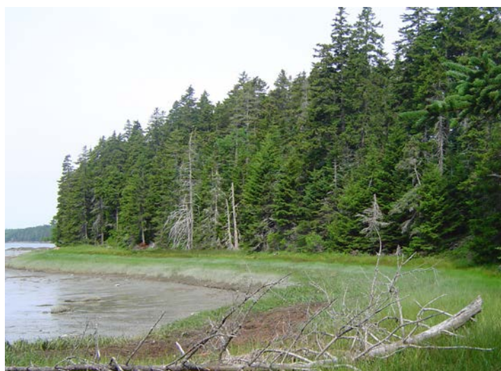
Crystal Cove Preserve, Oceanville

seeking quieter waters. For geology buffs, this preserve has one of the largest glacial erratic boulders found in Deer Isle! And yes, for generations, young people have sat on top of this rock.