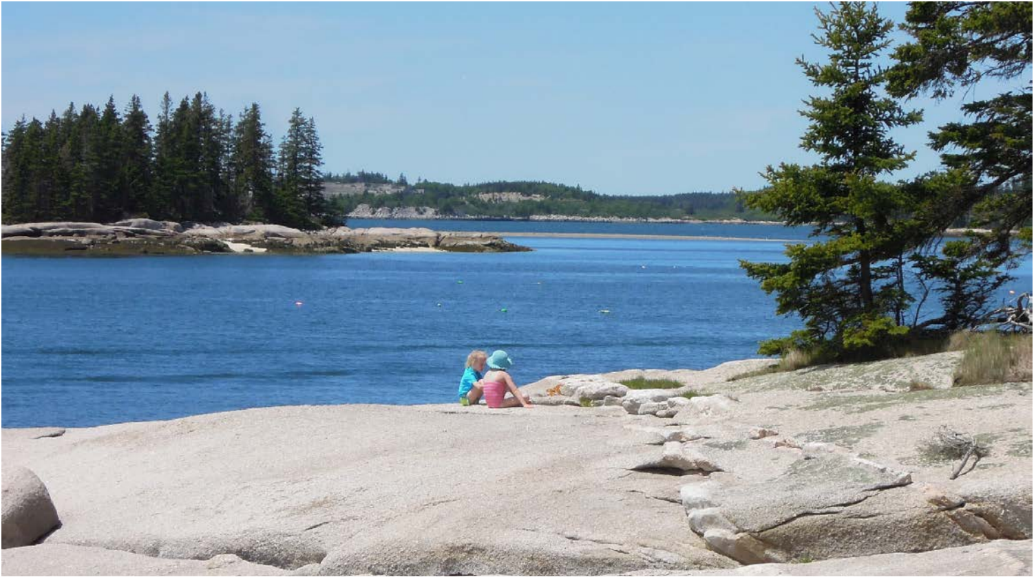
Two young participants from last year's Island Kayak Clean-Up on Wreck Island