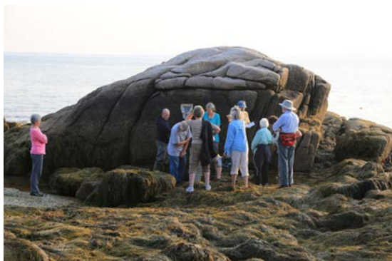
Rocky Shores Walk & Talk

Nonprofit Org. US Postage PAID Permit 76 Bangor, ME