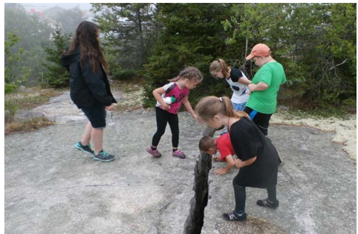
Camp Kooky Kids at Settlement Quarry Preserve

– proven in academic quarters – that a greater exposure to nature not only improves the health of individuals but of communities as well. As people become more appreciative of their natural surroundings, they become more motivated to work together to preserve and protect those surroundings. Moreover, the increased engagement with nature and with fellow citizens works to improve both individual health and community life.