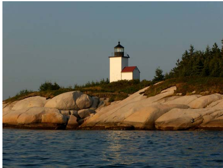
Mark Island Lighthouse